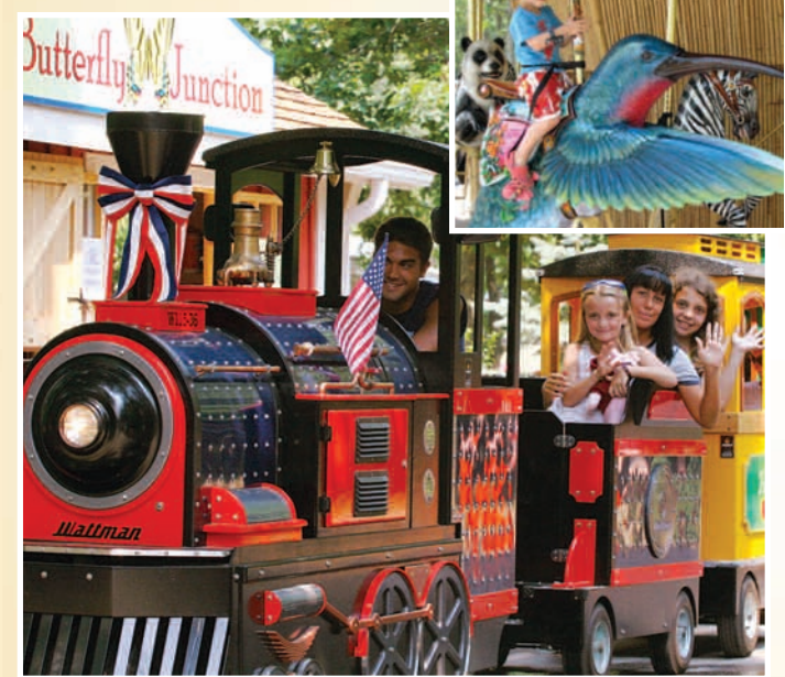
Owner & operator of the Hummingbird Express Train and Wildlife Carousel. Purchase Ride tokens at the Train Station.

The Zoo Society; a 501(c) 3 non-profit NJ corporation, is a private sector partner with county government working to improve the zoo for our visitors, staff and most of all the living creatures in our care.